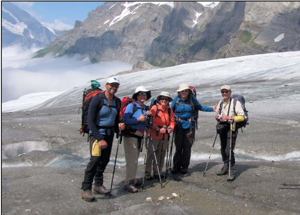
Swiss Glacier Trek.

This information should answer some of your questions about the trip and give you a better idea of what we do day-to-day. It doesn't hope to answer everything. If you have any questions please get in touch.