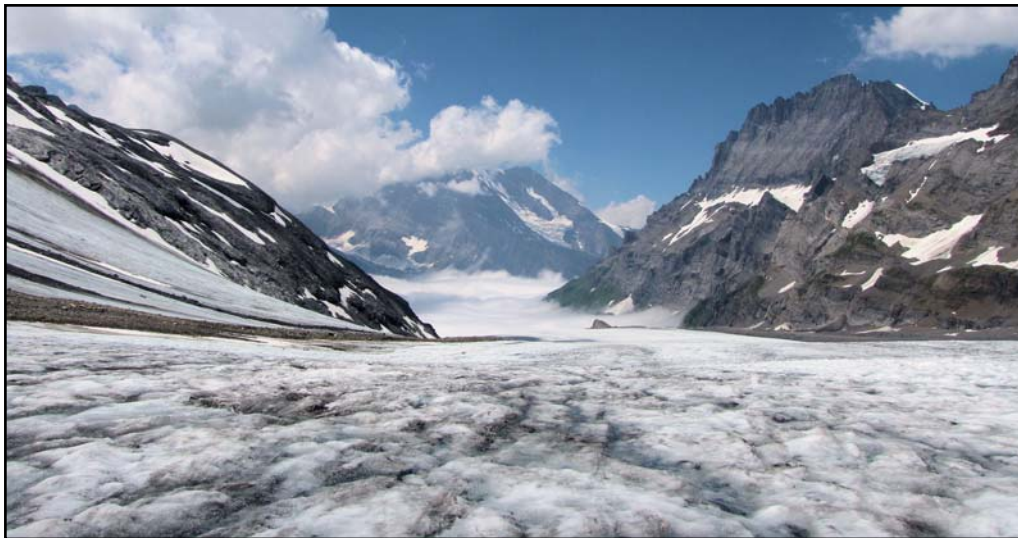
Good weather!

The Bernese Oberland is affected by a western continental climate which is usually warm during the day in July, but as in any mountain area there is a chance of bad weather in the mountains and rain could fall as snow on the glaciers.