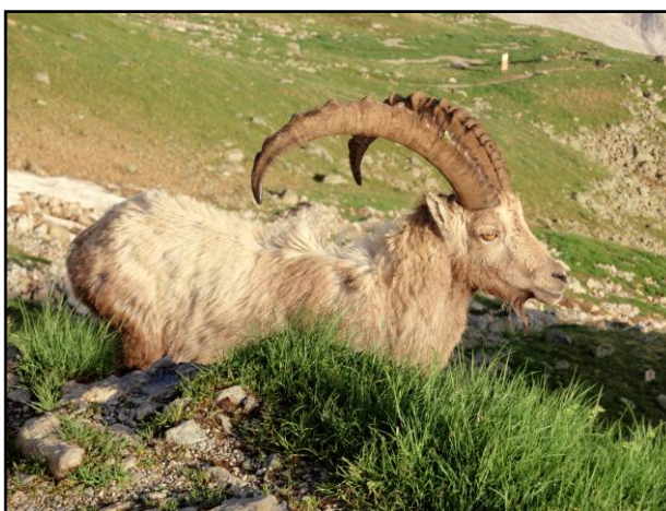
Ibex.

Now it's time to get the harnesses out and rope up – those who are not familiar with glacier travel will be shown what to do. We follow the glacier for 3 hours to reach the Mutthorn Refuge (2900m), which is situated on the edge of a rocky ridge. Views of the Eiger, Mönch and Jungfrau can be enjoyed from a terrace with a steaming mug of tea or a beer in hand – after 1300m of ascent you will have earned it! Walking time 6 - 7 hours. (B,D)