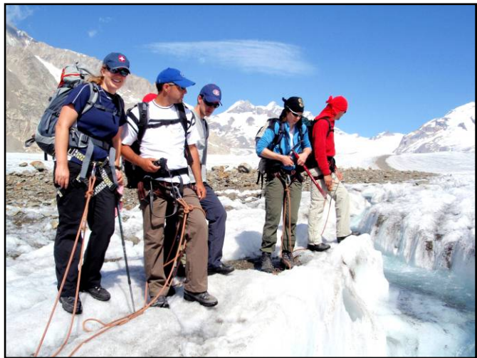
Crossing Aletsch Glacier.

There is an optional ascent of Oberaarhorn, a straight forward peak but due to the terrain and the exposure it is necessary to climb it in smaller groups. The return trip takes approx 3 hours and the first group will climb it this afternoon, returning in time for dinner. Walking time 6 hours, 350m descent followed by 560m ascent, plus the optional ascent of Oberaarhorn. (B,D)