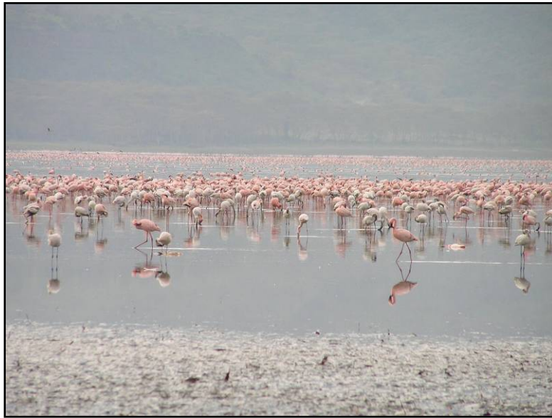
Lake Nakuru flamingos

This information should answer some of your questions about the trip and give you a better idea of what we do day-to-day. It doesn't hope to answer everything. If you have any questions please get in touch.