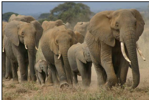
Elephants on the move.

On trek and on safari, all meals are provided and prepared by our own cook. We are happy to cater for vegetarians. This gives you a chance to sample some local Kenyan cuisine. All meals are provided except for the first and last day. Allow approx £6-10/US$10-18/NZ$15-26 for dinner, less for lunch.