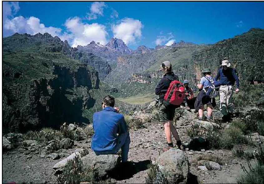
Above Gorges Valley

This information should answer some of your questions about the trip and give you a better idea of what we do day-to-day. It doesn't hope to answer everything. If you have any questions please get in touch.